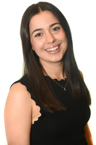
The final product