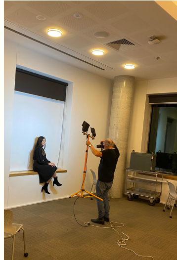
Behind the scenes...

People who attended the event were given the chance to receive multiple types of professional headshots until they were content, since the photographer was extremely friendly and accommodating. Furthermore, attendees were able to make new friends, network and choose from a delicious range of catered food. All of this was for the price of only $10!